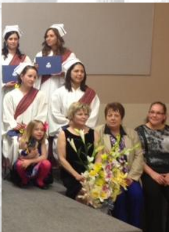
Prince Albert Practical Nursing Graduating Class, 2013

On May 10, 2013, the strength of the unruly winds couldn't keep out the more than 240 guests who gathered at the 30 th Annual Saskatchewan Urban Native Teacher Education Program (SUNTEP) graduation at the Delta Regina Hotel. The event celebrated academic achievements of five exceptional professionals earning their Bachelor of Education degrees from the University of Regina (U of R). The smiles, laughter, and memorable visits with Elders, dignitaries, special guests, families, friends, students, alumni, and staff created an unforgettable evening.