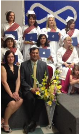
Prince Albert Practical Nursing Graduating Class, 2013

Dumont Technical Institute is the second largest practical nursing (PN) training providers in Saskatchewan. DTI offers its PN programs in Prince Albert, Saskatoon, and Regina. It has graduated over 200 practical nurses since 2000. Of these 200 plus graduates, 122 were from the Practical Nursing Program in Prince Albert (PA).