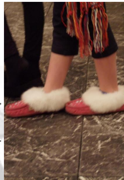
'Dancing Feet' at the SUNTEP Regina 2013 Graduation